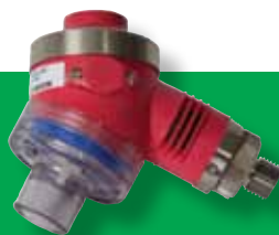
Rescue Pak w/MTV 601-4100